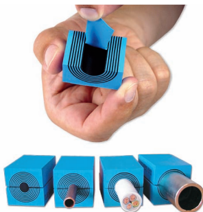
Multidiameter™ by Roxtec

Roxtec EzEntry™ – seals for cabinets and enclosures