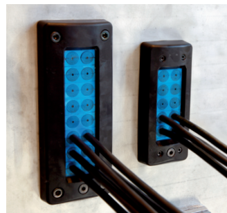
Sealed to UL/NEMA and IP ratings